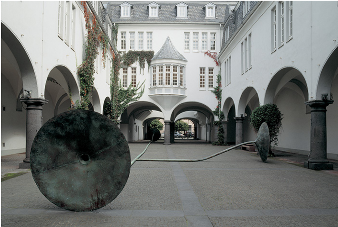
Voice Scope , 1994 | Copper | 500 x 3000 x 180 cm | Solo exhibition, Stadtgalerie Saarbrücken, Germany