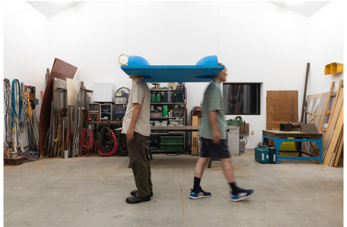
Lag Behind/Lag Forward , 2019 | Wood (painted) | Photo: Kazuo Fukunaga

ARTCOURT Gallery is pleased to present, “ Far Too Close ,” a solo exhibition of new works by sculptor Shiro Matsui.