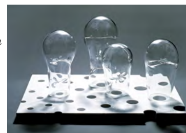
Recent work Inner Structure: Strings 4 | 1996 | Galss, marble Collection of The Museum of Modern Art, Wakayama

"Objects emit electromagnetic waves at a wavelength relative to their temperature. In the cosmic microwave background (CMB) captured by PLANCK satellite, slight fluctuations in temperature were discovered, backing up the present structure of outer space, and is filled with important scientific information that reveal the environment of the early period of the universe. The score uses the fluctuations' numeric values, but because of the the enormous amount of data, 'CMB' score would require 1,080 instruments and performers to play this mysterious symphonic music, according to Nomura.