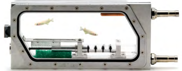
Recent work Medaka fish ( Oryzias latipes ) in Space from 0.5 Gravity Room (2001)