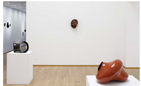
Solo Exhibition Genta Ishizuka: Absence ARTCOURT Gallery, Osaka, 2025 | Photo: Takeru Koroda