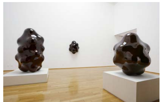
Solo Exhibition Genta Ishizuka: Polyphase Membrane ARTCOURT Gallery, Osaka, 2019