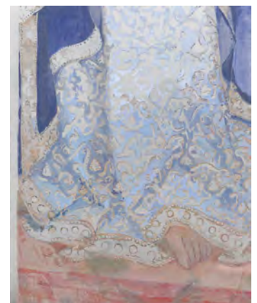
MIMESIS I - 2

Park Hyatt Kyoto / The Prince Gallery Tokyo Kioicho / Yasui Architects & Engineers, Inc. Head Office, Osaka Office / Kyoto Second Red Cross Hospital / Kojinkai Social Medical Corporation Hokkaido Ohno Memorial Hospital / Bank of Kyoto / Kyoto City University of Arts University Art Museum