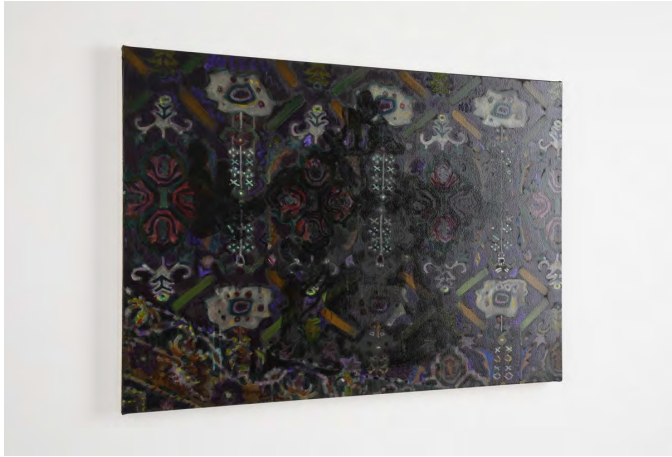
Seesaw | Oil on canvas | 61x91 cm | 2020