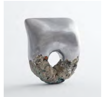
Sora-no-te | Glaze, tin | 8x11x3cm | 2020 *Reference work

Major Public Collections & Installation Locations Bank of Kyoto / Shinken-chiku-sha Office