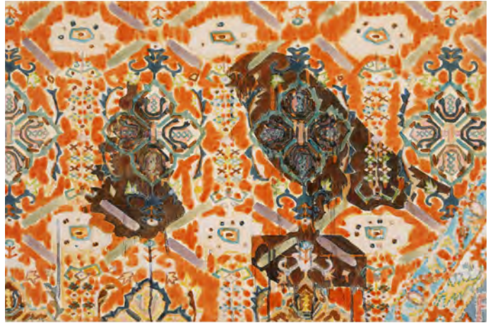
Tree owl | Oil on canvas | 61x91cm | 2020