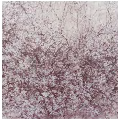
[left] ambient light - flower Oil on canvas | 100x100cm | 2000