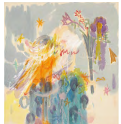
Annunciation | Oil, colored pencil on canvas | 65.5x60.5cm | 2021

2019 Small Infinity , MA2 Gallery, Tokyo 2018 15 Years , ARTCOURT Gallery, Osaka 2017 heART ~Shum Wa Kei Mei~ , InterContinental Osaka (20F Lobby), Osaka Collection 1 Emerging Images , Itami City Museum of Art, Hyogo 2016 WEWANTOSEE , 21st Century Museum of Contemporary Art (People's Gallery B), Kanazawa 2015 INCIDENTS 2015 , former sake brewery of Hachinohe Shuzou, Aomori 2013 The 24th Biennial of Illustrations Bratislava , Bratislava (Toured to five museums in Japan in '14-'15) 2011 Art in an Office , Toyota Municipal Museum of Art, Aichi 2010 Tokyo Wonder Wall 2000-2009 , Museum of Contemporary Art Tokyo Kazuma Kōike + Yasuyoshi Botan "A silent moment at Verónica Island" , hpgrp Gallery Tokyo 2009 Yuki Hayashi, Yasuyoshi Botan, Chisato Yamano: migratory - lost in the world- , ARTCOURT Gallery, Osaka 2006 Monthblanc de la Culture Arts Patronage Award Ceremony , Tokyo 2005 ūmawashi: Contemporary Art from Japan , Edinburgh International Festival Fringe, Merz Gallery, Edinburgh 2003 sukima the bathhouse , SCAI the Bathhouse, Tokyo / Command N, Tokyo 2002 The 5th Exhibition of the Taro Okamoto Memorial Award for Contemporary Art , Taro Okamoto Museum of Art, Kanagawa