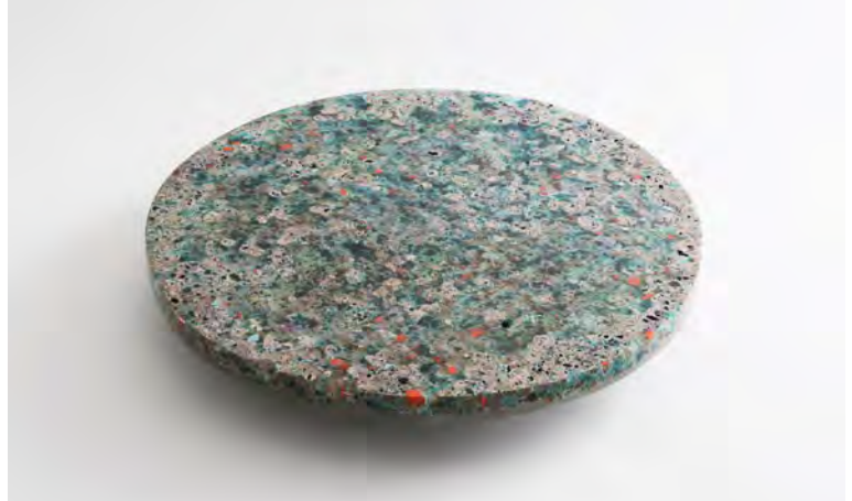
melting point | Glaze, resin | 5x50x50cm | 2015 *Reference work

Mainly working in ceramics, Saijo Akane focuses on the fiction that lingers around pottery when handled as a “surface” concealing an empty interior space, while at the same time being a very much substantial (real) medium, possessing a definite shape that can be visually admired for their glossiness or color, and texture that can be ascertained by hand. Moreover, Saijo offers a unique worldview in which she incorporates an axis of time into the spatial existence of the vessel by layering invisible elements such as personal stories or others’ history. Here, she endeavors to deepen her sculptural series of works, which she began in 2012, composed of only the “outer skin” of glaze after the removal of the foundation of clay which equates the work’s body. These works of pottery will expand our perception and understanding, as they act as an ambivalent presence that blends together truth and falsehood, space and time, light and dark, while half-exposing the emptiness hidden inside.