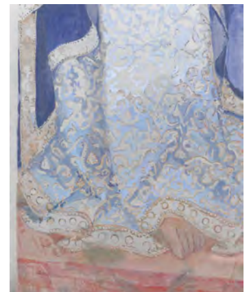
MIMESIS I - 2 Oil, beeswax, metal powder, chalk ground on canvas | 162x130.3cm | 2016 *Reference work

Park Hyatt Kyoto / The Prince Gallery Tokyo Kioicho / Yasui Architects & Engineers, Inc. Head Office, Osaka Office / Kyoto Second Red Cross Hospital / Kojinkai Social Medical Corporation Hokkaido Ohno Memorial Hospital / Bank of Kyoto / Kyoto City University of Arts University Art Museum