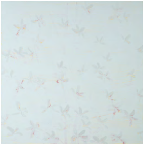
[left] ambient light - flower Oil on canvas | 100x100cm | 2000