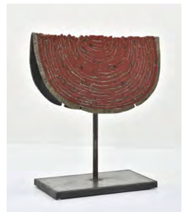
cape, cave | Earthenware, glaze | 120x60x140cm | 2014 *Reference work

*Please contact Michiko Kiyosawa or Yuki Hamada at ARTCOURT Gallery for any inquiries including photographic materials.