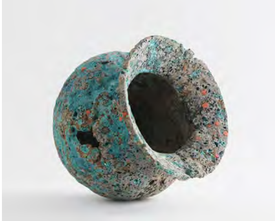
sunya | Glaze | 40x35x35cm | 2014