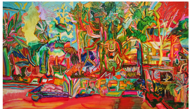
On the way home Oil on canvas 88 x 150 cm 2021 *Reference Work