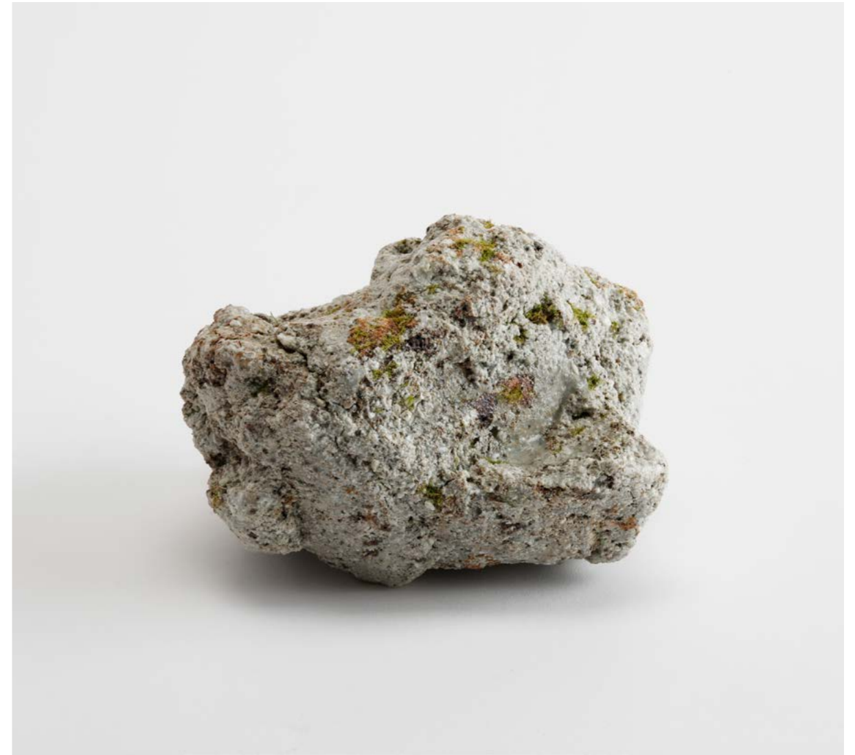
土と火 Soil and Fire