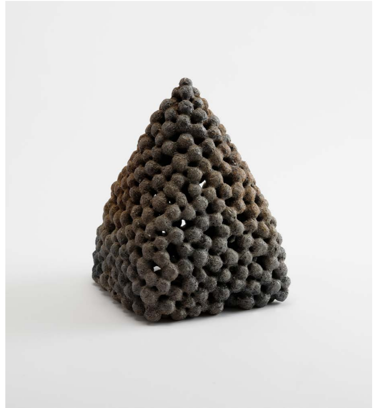
庭の星 Stars in the Garden