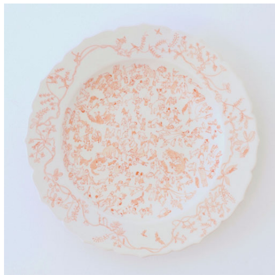
Dog-People Land — Large Plate 2015 | Porcelain | φ 29 cm