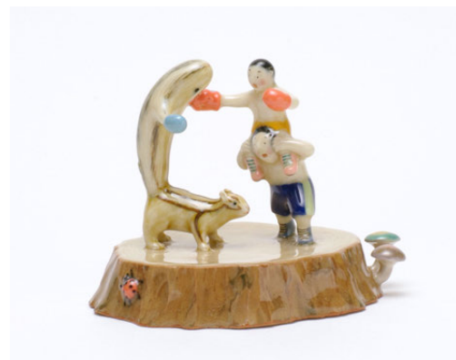
Chipmunk-Weight Chicken Fight Title Match 2015 | Semi-porcelain | h8.5×9.5×8.5 cm

◆ Reception : November 12 (Tue) 6.00 pm–