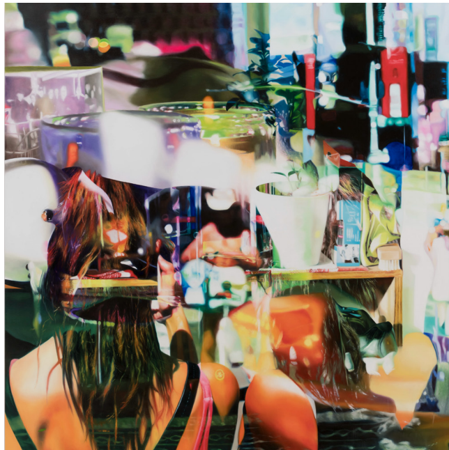
Seishu Niihira | Diffraction #1 2017 | Oil on aluminum panel | 160 x 160 cm

ARTCOURT Gallery presents DiVISION , a solo exhibition of new works by Seishu Niihira.