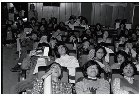
《 Six-Eight Time 》 1981 Performance, installation and moving image (video)

Sketching by Video (1974) — Video was projected while sketching with ink on tracing paper, making reproductions every fifteen seconds and repeating seven times. Consists of seven sheets of blueprint and one sheet of tracing paper.