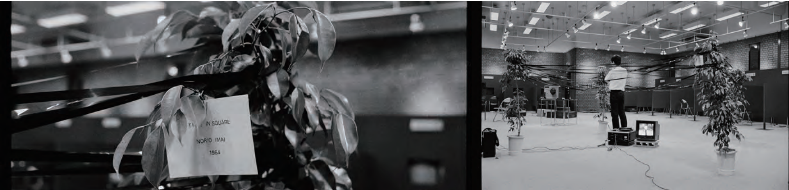
images: 《 TIME IN SQUARE 》 Performance, installation, moving image (video) / 1984