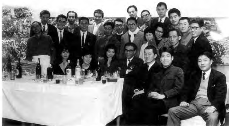
Gutai members at the 13th Gutai Exhibition, Takashimaya Department Store, Osaka, December 1963.