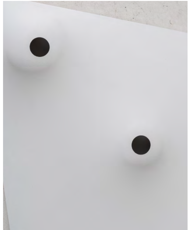
White Ceremony - Holes Acrylic, cotton cloth, plastic mold | 255.3 x 316.5 x 18 cm | 1966/2014