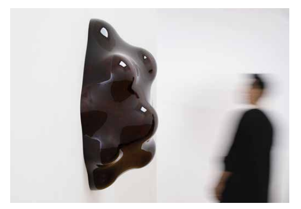
[ Reference work ] Genta Ishizuka Surface Tactility (on wall) #4 2021 Urushi, hemp clot / Kanshitsu-technique | 137x98x52 cm