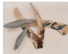
[Reference work] For Crows & Roses 1986 | Acrylic on granite, zelkova, and brass

Mainly works with large-scale relief sculptures. For Crows & Roses , which combines granite, cut paper-thin, with Japanese zelkova wood and brass, received attention as a work that goes between the realms of sculpture and painting that has a lightness that overturns the massiveness of the material.