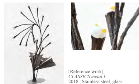
[Reference work] CLASSICS metal I 2018 | Stainless steel, glass

Acquires working space at a glass workshop, and develops a series by combining stainless steel and glass. Begins the Twiggy Project .