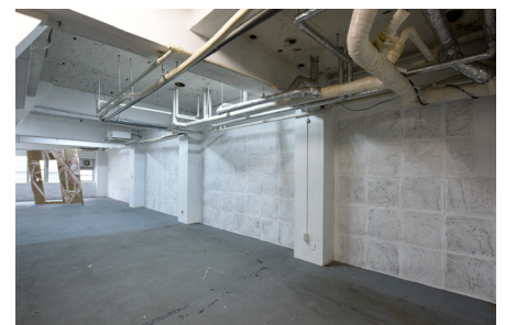
NO SIDE [top, upper middle photos]

2017 | Wood, plaster, pigment, spray paint