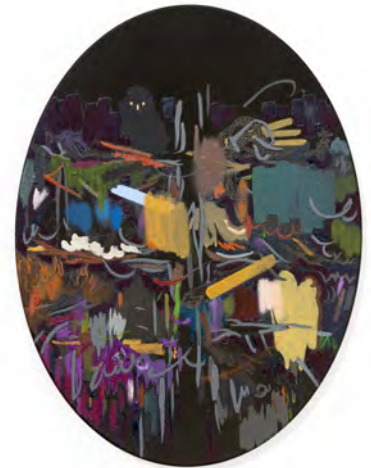
Sign , 2015 h 40.5 x w 30.5 cm Oil, pencil, gesso on cotton