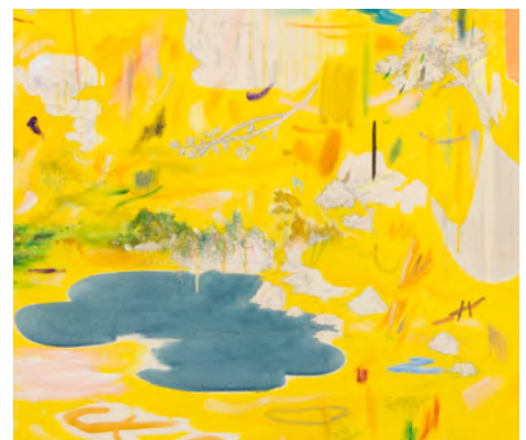
Details from the left work