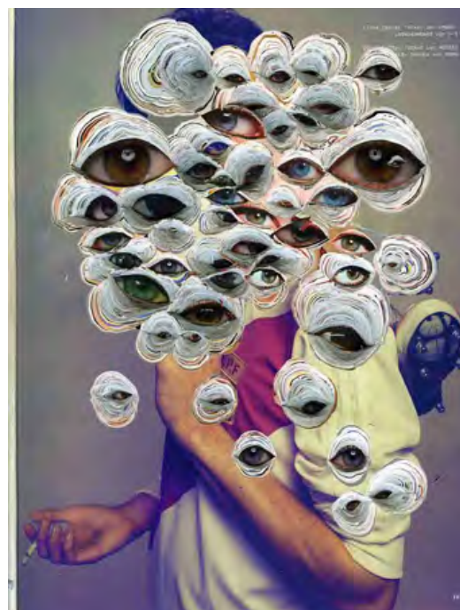
““Feel Your Gravity” 2005 30 x 25 x 1 cm / magazine (Work for reference)

Kadist Art Foundation, San Francisco, USA Museum of Old and New Art Tasmania, Australia Nasher Museum of Art at Duke University, USA Artsonje center, Seoul 21st Century of Contemporary Art, Kanazawa, Japan Museum of Modern Art, Wakayama, Wakayama, Japan