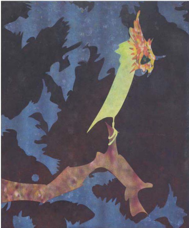
"flicker forest" 2014. H 72.5 cm x W 60.7 cm. Acrylic on canvas.