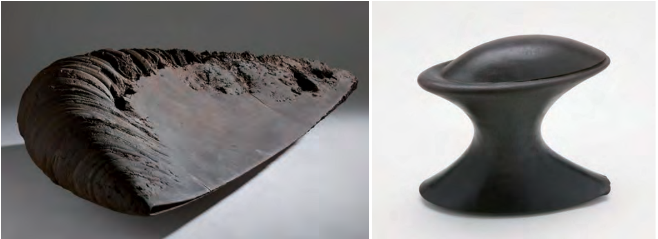
Metavoid 21, 2013, Ceramics, 25×157×68 cm / Incubation "Portrait", 1975-2013, Ceramics, 33.5×38×19 cm