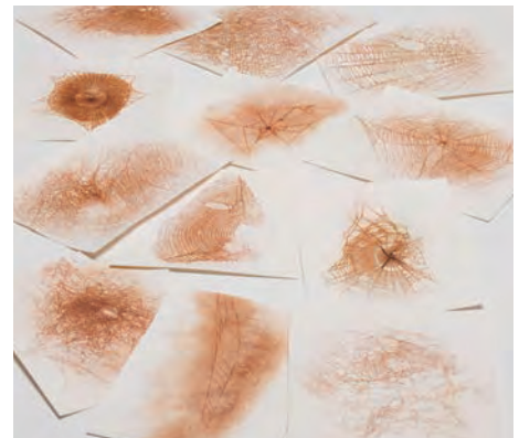
a series of slabs with prints of spider web prints, 2012-2013