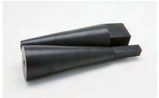
Incubation "Perspective", 1978-2013, Ceramics, 14.5×53×20 cm