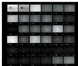
'moon' score , 1979 (1979.1.1)

Five lines were copied onto the films, and photos of the moon were taken with those films. However, because my hands shook and the position was unstable, the moon was randomly placed between the 5 lines. The work is presented as music, and the process is still in progress. When the photo of each moon taken at random are regarded as musical notes and are actually played, we found music. This experiment made us aware that we coexist with a movement of enormous scale and discipline, and it gave me the insight for my future works whereby natural phenomena or the relationship between the universe and time were developed and elaborated.