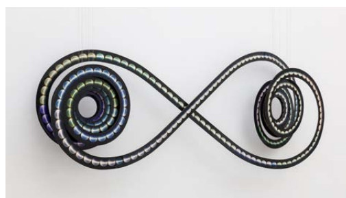
The Sun on Lat. 35°N, 1982-1987 *reference work

The Sun on Lat. 35°N consists of traces of the sun taken at a location at latitude 35 for a year. When photos that were taken for A Spin in Curved Air (1980) were collected for a whole year and the curves for each day were connected, a spiral form that represents the symbol of infinity emerged. This is a discovery of the "Cycle of time", which resembles the recurrence of the seasons which we experience. It can be said that this is a visualization of the "Recurrence of time". To feel close to such awesome and dynamic movements is to be able to perceive familiar scenes that are repeated daily as the "appearance" of nature itself, which is invaluable to us.