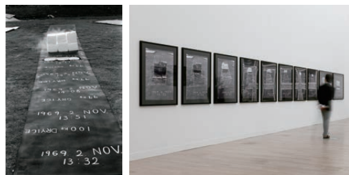
Dryice: 1969 , 1969

This work represents the idea that "Nature will reveal its genuine features with time". By moving dry ice that sublimates in normal temperature, photographs were taken by a fixed camera while the changing weight and time of the dry ice were recorded. The process was repeated. When one accepts the image that is generated by nature's order and energy, one can actually feel, in the series of arbitrary forms recorded, the emergence of an inevitable power that runs through the whole phenomenon.