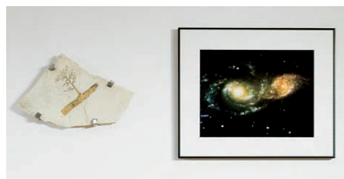
Plagiophyllum & NGC 2207+IC 2163(1.63 M.L.Y) 2002-2006 *reference work

150 million years ago, the plant life of the Jurassic Period was lush and thriving; their fossils are discovered in the present. 150 million light years far away, the light of the galaxy is captured in the present. I am looking for an intuitive imagining of the vastness of eternity and space by attempting to correspond, in a given time, the remoteness of time during which plant becomes stone to the straight-ahead distance traveled by light in space.