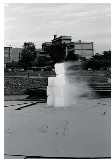
Dryice , 1969 (1969.10.19) “2nd Contemporary Plastic Art” Kamogawa Park, Kyoto

New works (4 pieces, the series of “A Fossil Branch & A Galaxy Light”)